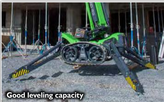
Good leveling capacity