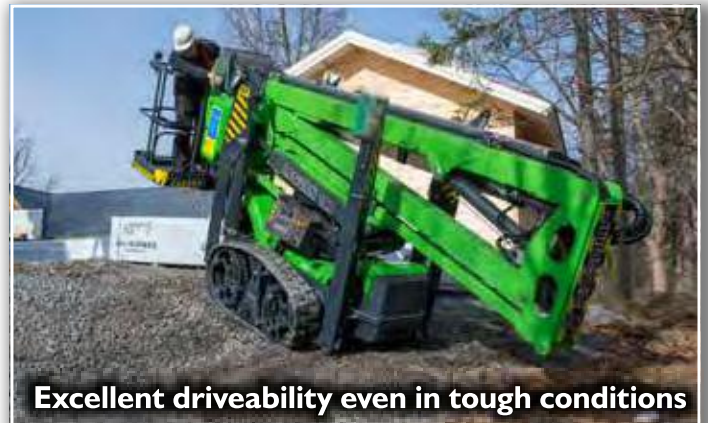
Excellent driveability even in tough conditions