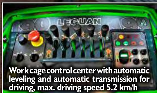
Work cage control center with automatic leveling and automatic transmission for driving, max. driving speed 5.2 km/h