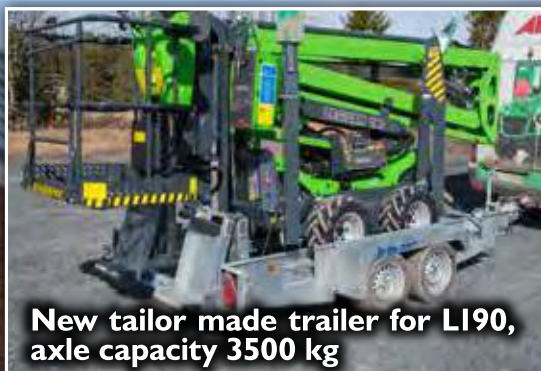
New tailor made trailer for L190, axle capacity 3500 kg