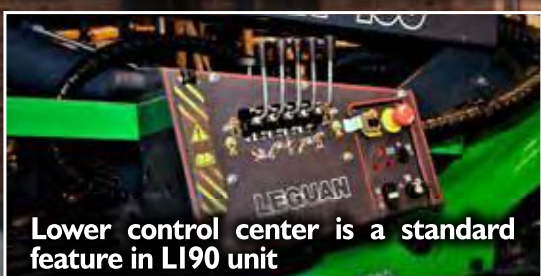
Lower control center is a standard feature in L190 unit