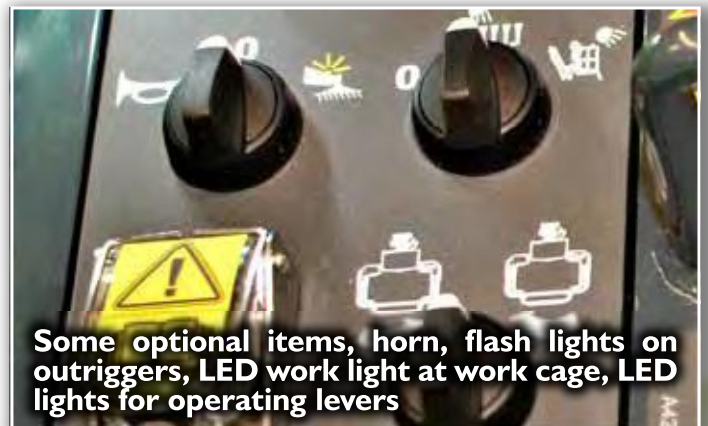
Some optional items, horn, flash lights on outriggers, LED work light at work cage, LED lights for operating levers